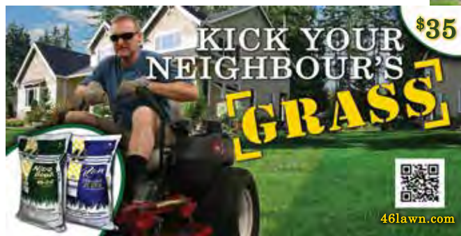
Point of Sale posters for seasonal promotion

Postcards with NPK Index, brief explanation and QR Code to mobile site with recommended fertilizing times throughout the season.